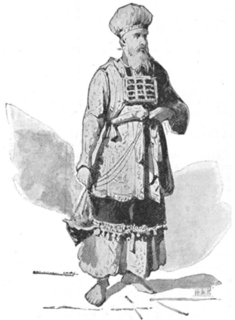
HIGH PRIEST IN ROBES AND BREASTPLATE. —Lev. viii. 8.