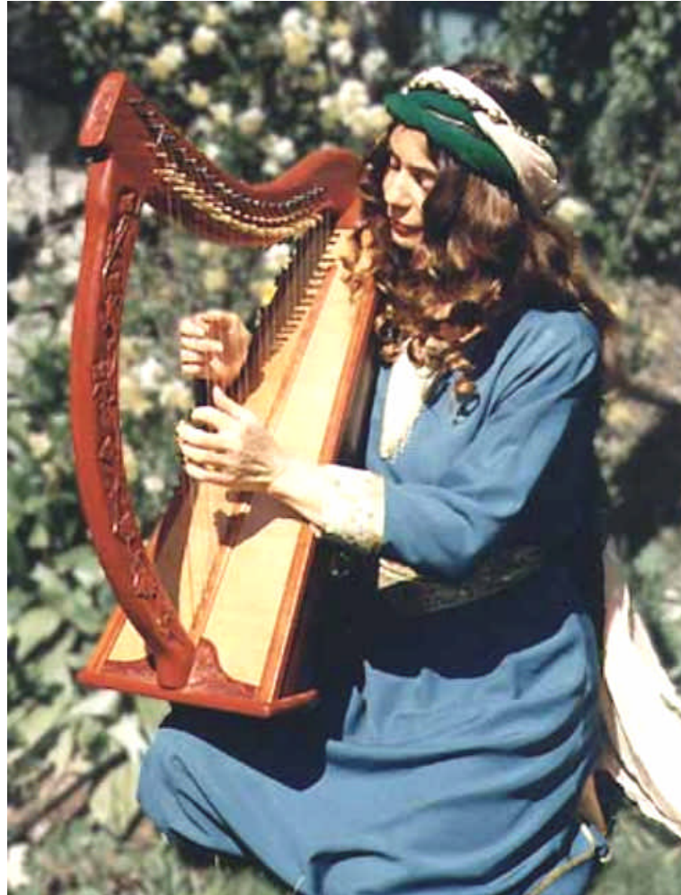
Figure: A 22-stringed Nevel.

playing, without stopping to re-tune the harp. It is known that the Levitical choir performed these changes frequently in the awesome music of the Beit HaMiqdash . Below is a picture of a Nevel, reconstructed by Micah and Shoshanna Harrari of Yerushalayim.