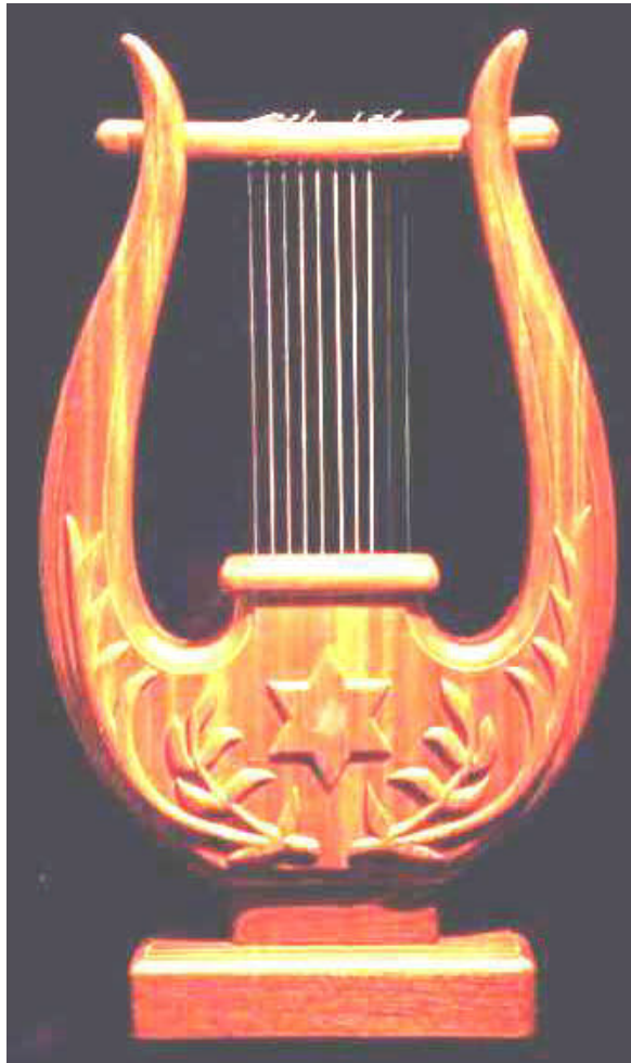
Figure: A 10-stringed Kinnor.

The harp, whether the Nevel or the Kinnor, can be played in three different ways. The first is to play a known tune. The second method is where the musician begins to play the harp, sensitive to the direction of the Almighty. The ancient prophets played like this — the prophet began to play his harp freely and then would feel a hand ( yad ) on his shoulder. At this time the tune and words were coming from the Almighty, and the song was the prophecy. The Nevel was only used for joyful occasions: weddings, homecomings, Temple Services, and for the simple act of praising and worshipping the Creator of the Universe. King David composed the psalms using the accompaniment of both the Nevel and the Kinnor (lyre). In solitude, he reached up to the throne of Heaven, and as the strings vibrated, his heart would fill with joy, and the Ruach HaQodesh entered into his being and gave him the inspiration to write the Psalms. The sages teach that the musical notes played in the Beit HaMiqdash are actually coded in the Hebrew Scriptures, but that the key of translation has been lost over time.